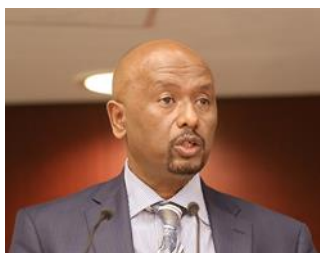
H.E. Seleshi Bekele

Minister of Water, Irrigation and Electricity, Ethiopia