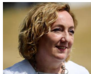
Hon. Emanuela C. Del Re